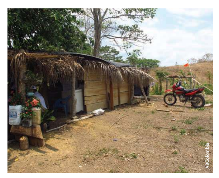
Paquemas temporary housing

If it wasn't for the accompaniment of this community by ASOPAQUEMAS, the National Secretariat of Pastoral Social of the Catholic Church (SNPS) and the international community – many of the European Catholic International Development Agencies support this community including ABColombia members, CAFOD and SCIAF – it is very unlikely they would have been able to return, or remain on, their land. This national and international awareness and accompaniment of the community is used in a variety of self-protection models adopted by communities during the conflict in Colombia in order to stay on, or return to, their land.