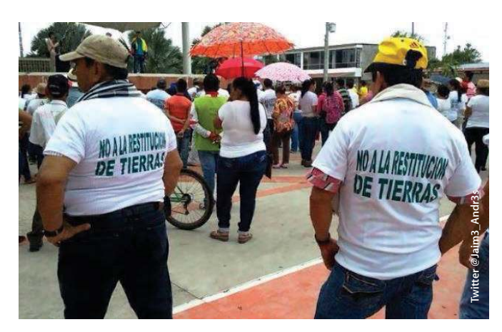
Protester with T-shirt stating: No to land restitution