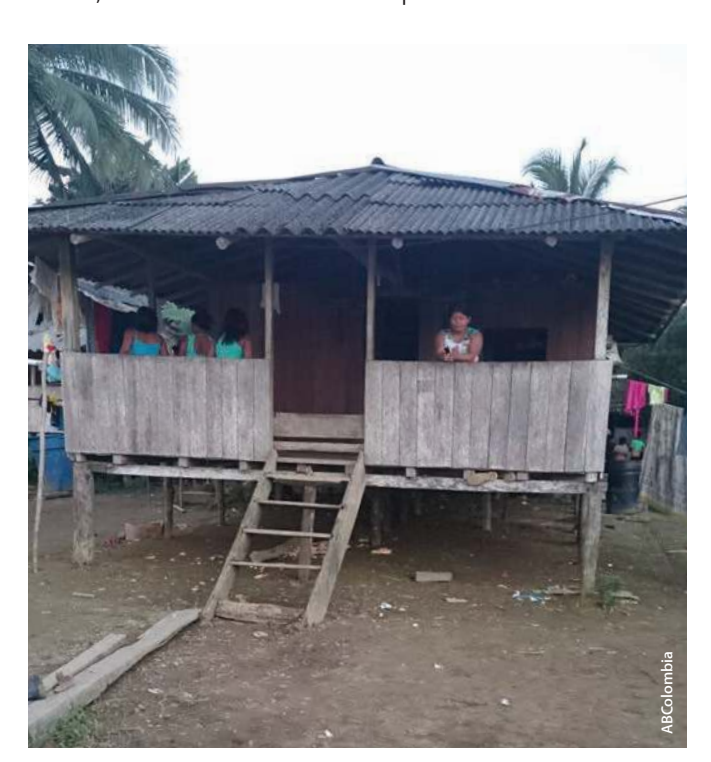
Indigenous Community returned after displacement.

Despite Law 1448, which recognises land ownership and the rights of victims to have their land returned, communities continue to face risks when registering for land-restitution and seeking to return. Peasant farmers and ethnic groups that recover land under this law report a lack of State support over the long term.<sup>17</sup> They also run the risk of being once again dispossessed of their territory due to the continued presence of illegal armed groups (PDPGs as well as guerrilla) and occupiers of the land who took possession once the community had been forcibly displaced – these are known in Colombia as 'occupiers of bad faith'.The bad faith occupiers continue to have links to the paramilitary groups. In addition, communities face food insecurity due to the lack of access to crop and credits needed to work the land, all of which challenge their ability to remain, as illustrated in the case of Paquemás.