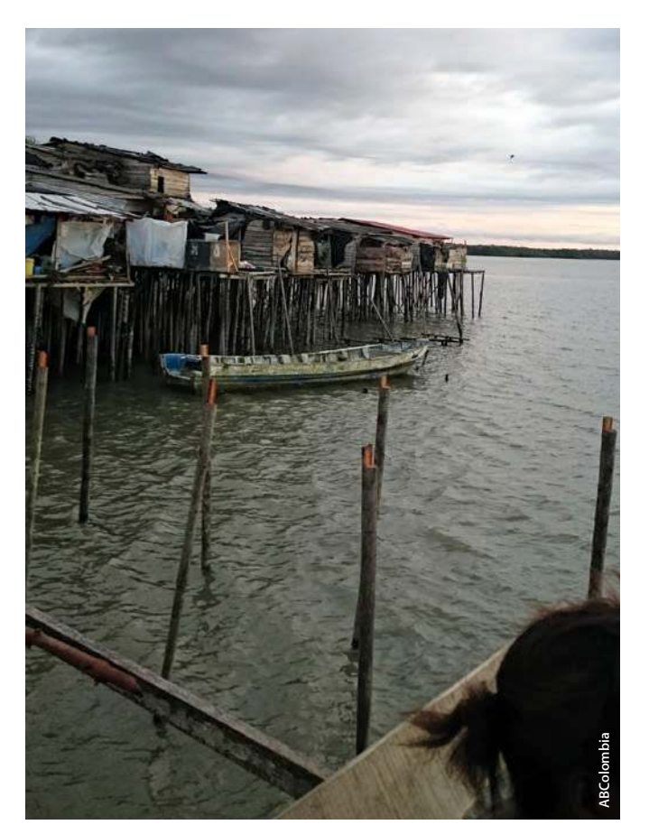
Artisanal fishing community of Puente Nayero

The international community should focus their financial and political support on grassroots organisations and CSOs that are already protecting rights and building peace at the local level. CSOs are fundamental to the promotion of democracy, good governance and vital for the construction of policies on development with social justice. They are key to the provision of collective organisation and access to technical skills that are required to balance the inequality of power and facilitate dialogue between victims and the State and between citizens and corporations.