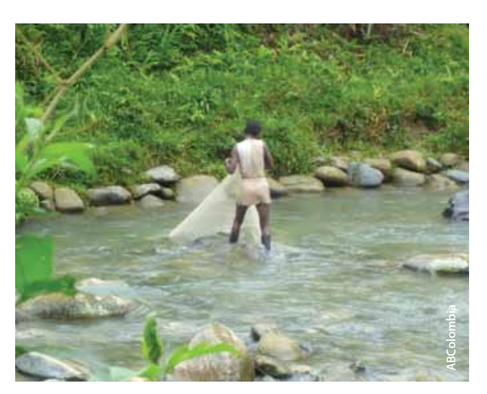
A woman from a COCOMOPOCA community carries out traditional fishing

In April 2015, Colombia's Constitutional Court and Congress highlighted a health crisis due to lack of adequate services and poverty in Chocó - the maternal mortality rate was more