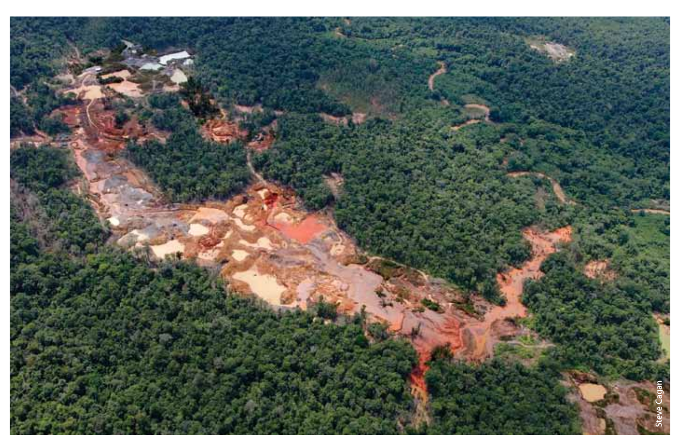
The devastating impact of mining in Chocó

Forces between 2005 and 2010 was described by the UN Special Rapporteur as systematic.<sup>197</sup> Further complicating the situation is US-designed counter-insurgency training that the Colombian Army has received which promotes polarisation with the view that 'you're either for us or against us.' This sees citizens as potential enemies as opposed to neutral individuals or victims.<sup>198</sup>