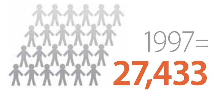
In just one year (1997), 27,433 people in Chocó were displaced by the conflict

Under the changes to the 1991 Constitution, Afro-descendants, who made up 75 per cent of Chocó's population, had achieved recognition of collective land rights to territory which they had occupied ancestrally. Law 70 of 1993 enacted these changes, and also enshrined protection of Afro-descendants' cultural practices and traditional uses of natural resources, as well as guaranteeing the economic and social development of their communities. By 1996, many had formed the required community structures and had received their formal land titles or were in the process doing so. In the same year there arose the possibility of the construction of an inter-oceanic link between the Pacific Ocean and the Caribbean Sea and land prices in Chocó increased by about 1000 per cent. 42