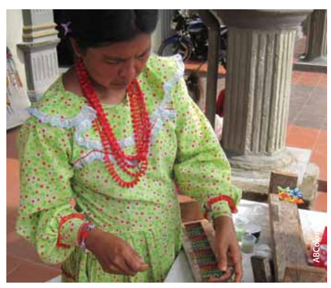
An Embera indigenous woman in Quibdó makes typical jewellery

CGL Buriticá stated also in the COCOMOPOCA case that they were open to discussing withdrawing their titles, but emphasised their willingness to see how they could share profits of exploration with communities.<sup>134</sup> It also stated that it was, at the time, unaware of the communities' land claim and of the restrictions on granting concessions to companies when the land in question was in the process of being considered for collective titles under Law 70 for an Afro-descendant community.