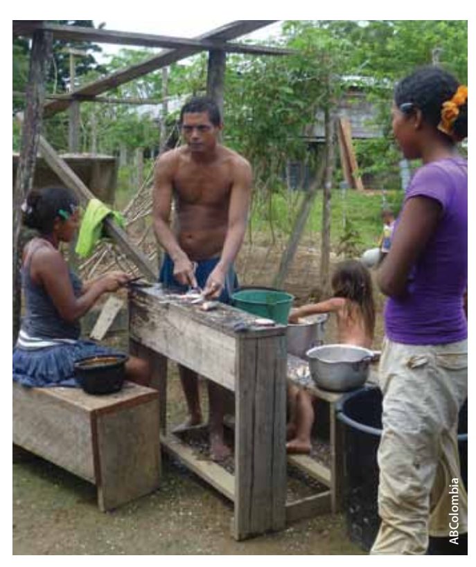
A family in Chocó prepare fish

The Class Action taken by communities focuses on the negligent behaviour of State authorities and their failure to prioritise legalisation of small-scale mechanised mining within a strict framework that includes environmental criteria. It asks the Tribunal to order the State to establish a comprehensive programme of rehabilitation for Río Quito and a health care plan for the local population. The Communities of Paimadó presented this to the Administrative Tribunal in Bogota in 2011. However the slowness of the judicial system means that as of October 2015 there still had been no decision; meanwhile the river continues to be contaminated.