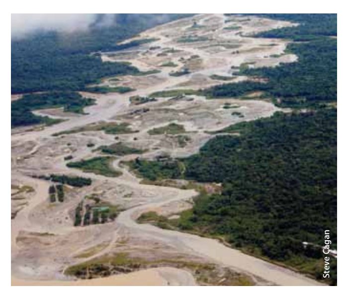
The devastating impacts of mining on Río Quito

In the case of this particular community, the only official support they felt they had received was from the Human Rights Ombudsman (Defensoría): 'The Human Rights Ombudsman attends to us when we requested it and they know that there are physical attacks against people in our community. When a young man was killed, the Human Rights Ombudsman called upon the criminal gangs to respect the right to life.' The communities told ABColombia what they wanted was a state administration that worked with them to address these problems, '[t]he public officials should be working hand in hand with us, recognising that we are facing a very thorny issue'.