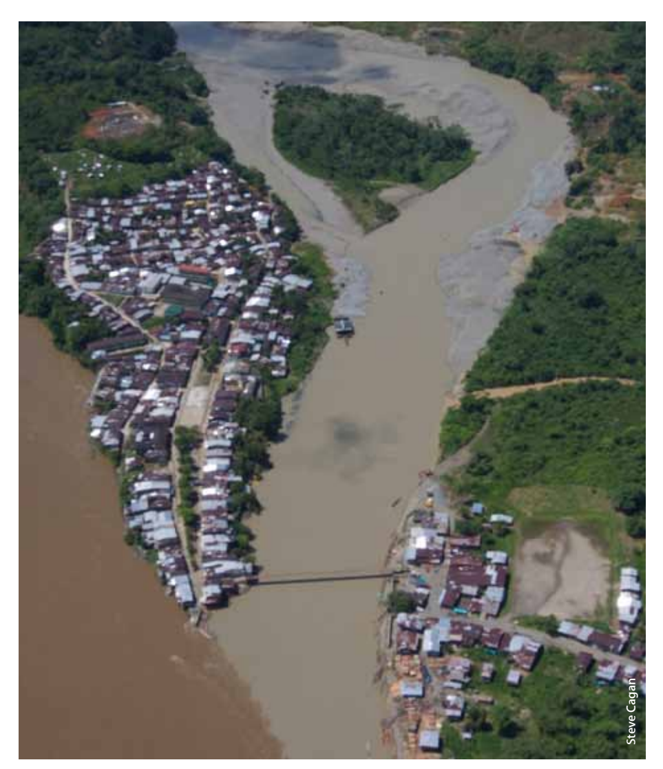
Sediment is clearly visible in Rio Andagueda, close to Lloro

Other ways to make it more difficult to mine in Chocó would be to restrict the availability of mercury and prevent heavy machinery from entering the region - it currently enters through the towns in Chocó apparently with the full knowledge of public officials.<sup>80</sup> The fact that much of the machinery generally passes through towns means there should be ways of preventing its onward journey at that point, because once these machines are established in the river, the communities live in fear of a backlash against them if they are removed by the authorities.