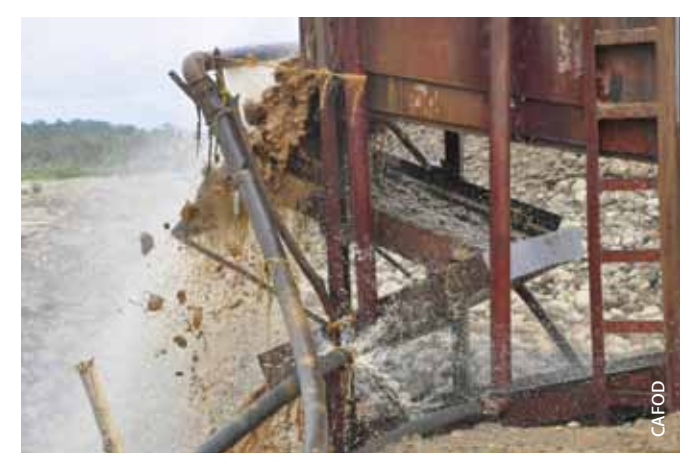
Small-scale mechanised gold mining

The European Union (EU) is developing legislation on conflict minerals which, although limited - covering only four minerals (tin, tungsten, tantalum and gold) - it will make a difference for countries like Colombia whose conflicts are intensified by trade in conflict minerals.<sup>20</sup> The EU legislation on conflict minerals was presented by the European Commission to the Parliament as a voluntary set of principles. But instead of taking a backwards step and approving another set of voluntary principles, the European Parliament decided to accept the proposals of INGOs and voted for an amendment to make the requirements legal and binding. If the UK government wants to fulfil the commitment made during the previous coalition government to not downgrade human rights to commercial interests, it will have to ensure that the European Parliament proposal on conflict minerals is not only mandated by legal requirements but also ensure that the implementation is vigorous. The UK also has to address the backward step taken in national legislation on access to the UK Justice System for the victims of UK registered or headquartered companies.21