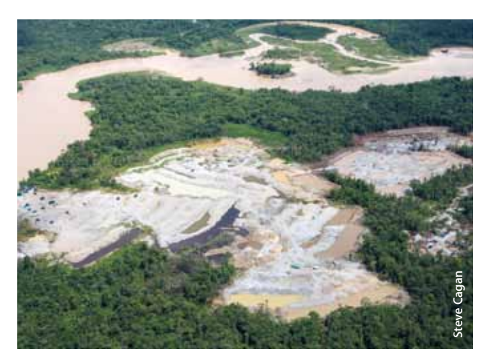
The devastating impact of mining in Chocó