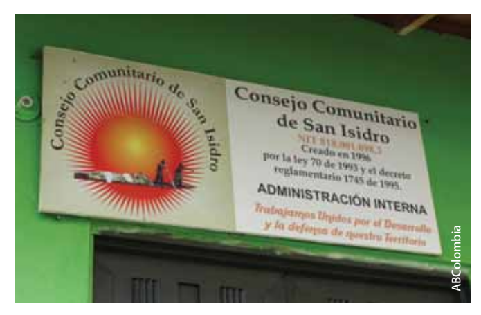
Community Council (Consejo Comunitario) of San Isidro, one of the afro-Descendant communities along the Río Quito

In April 2009, as a result of the commission, the 24 retros were removed from the river. However, the failure to arrest and prosecute the owners and/or operators of the machinery, in spite of their identities being known, meant the practice continued.<sup>69</sup> By 2014 the National Ombudsman's Office reported that mercury had contaminated at least eight of the major rivers in Chocó: the Atrato, San Juan, Andágueda, Apartadó, Bebará, Bebaramá, Quitó and Dagua.<sup>70</sup>