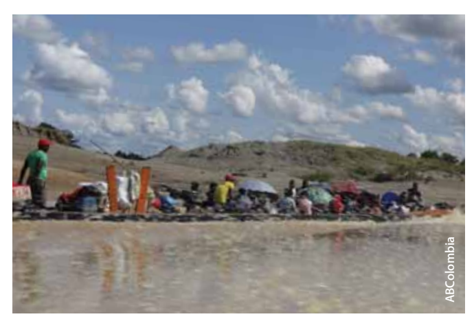
Community travelling along the river in Chocó

Companies need to be proactive in Colombia in seeking to set up from the outset channels of communication with communities. The situation in Chocó when MNCs were submitting their applications for mining concessions from the early 2000s onwards was, and continues to be, one of conflict, violations and abuses of human rights and mass forced displacements. AGA was aware of the level of conflict. They state, 'a number of the areas for which AGAC [AngloGold Ashanti Colombia] had applied for mineral tenements were deemed unsafe and were ultimately declared to be in Force Majeure due to the inability to ensure safe access of its employees to mineral exploration sites. 193 Continental Gold Buriticá (CGL) stated that they had not entered the area because of the conflict.<sup>194</sup> This conflict and displacement and lack of an accurate land registry were all on public record. NGOs, the UN and others published information on the human rights situation in Chocó. In fact, the situation in Chocó is particularly well documented, including the collusion between the military and paramilitary forces, as well as the operations of the guerrilla groups and the human rights violations and abuses committed by all the armed actors.