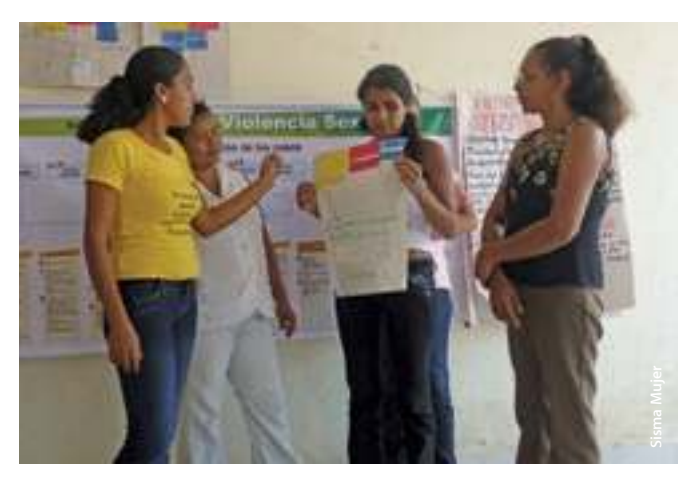
Women participate in a workshop run by Sisma Mujer

As the former UN Special Representative on Sexual Violence in Conflict, Margot Wallström, said in her May 2012 visit to Colombia, 'I understand that the country as a whole wants to look to the future, instead of dwelling on the past, but there can be no lasting peace without security and peace for women.' 172