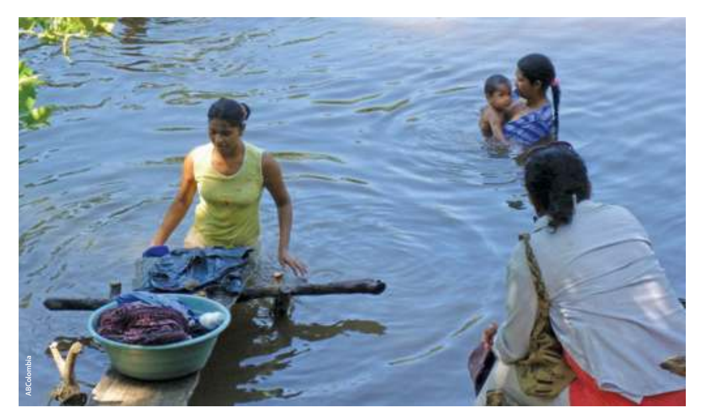
The everyday life of women in remote rural communities

The lack of response from Security Forces, despite knowledge of this practice, is a factor that allows sexual violence against girls and women to go unpunished. When questioned by an investigative journalist regarding the forced prostitution of girls in a mining area, the police replied that as the mines were in rural areas – where the conflict was more acute and access was more difficult – the crime therefore fell within the army's jurisdiction.<sup>69</sup> However, the military maintained that crimes against minors fell within the jurisdiction of the police.<sup>70</sup> As a result, each see jurisdictional responsibility as belonging to the other, and children are left exposed to prostitution with no state intervention to protect their rights. As a direct consequence of the culture of violence and poverty resulting from the armed conflict, it is estimated that between 20,000 and 35,000 children have been forced into commercial sex work.71