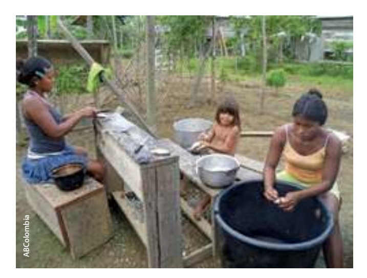
Girls from Chocó de-scale fish outside their home. The conflict between all armed actors is particularly intense in Chocó and continues to affect all civilians in this region.

Sexual violence challenges conventional notions of what constitutes a security threat... (it is) cheaper than bullets, it requires no weapons system other than physical intimidation, making it low cost, yet high impact." UN Women<sup>38</sup>